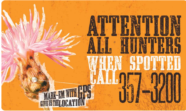
Figure 3. Call-to-action programs encourage hunters to report new invasions of spotted knapweed in eastern Montana to local weed departments.

populations in remote areas. Using light utility helicopters (e.g., Hughes 500 model) that can travel slowly (about 12 miles per hour) and close enough above the ground (about 50 feet), trained observers can visually discriminate weed patches in vegetation, even when the colors of both are similar, and map them with mobile GIS. DASM is a useful method to quickly and regularly search remote or inaccessible sites, especially near the advancing front of wind-dispersed plants having high survival rates, such as rush skeletonweed, which occupies regions adjacent to eastern Montana.