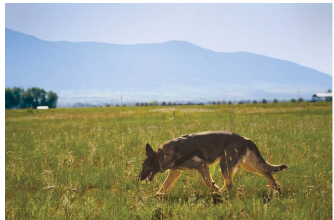
Figure 4. Search dogs can thoroughly cover large areas and detect obscure, low-density plants better than human surveyors. "Nightmare" searches for the odor of spotted knapweed in a dryland pasture near Bozeman, Montana.

While the cost of prevention is paid in the present, its benefits lie in the future. Therefore long-term measures of success are optimal and include comparing future inventories to baselines to determine if strategies were effective over time. Prevention would be considered effective if high-risk sites remained weed-free and ineffective if new weeds establish and persist.