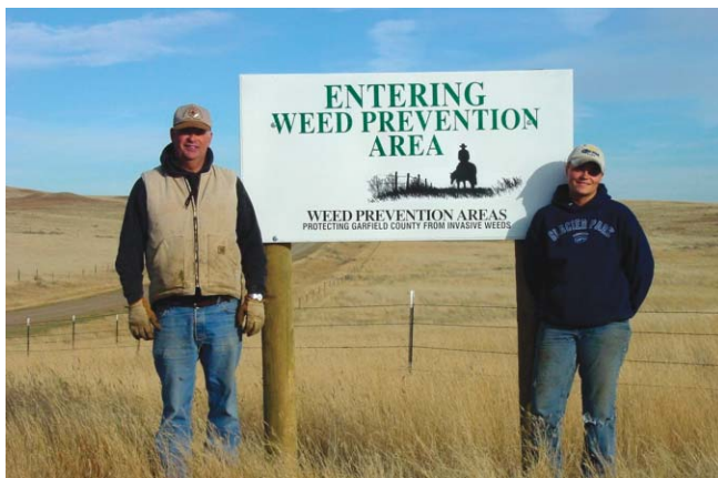
Figure 2. Weed prevention area signs mark weed-free areas and educate visitors.

To reduce introductions, prevention measures in WPAs focus on the most important vectors and target weed spread as a factor of human activity. Human-related pathways in eastern Montana include transportation corridors, recreation, purposeful planting as ornamentals (e.g., saltcedar), and